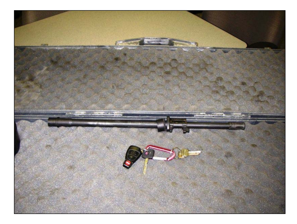
Page 5 of 24 Case 3:05-cr-00213 Document 30 Filed 08/04/2006 Page 5 of 24