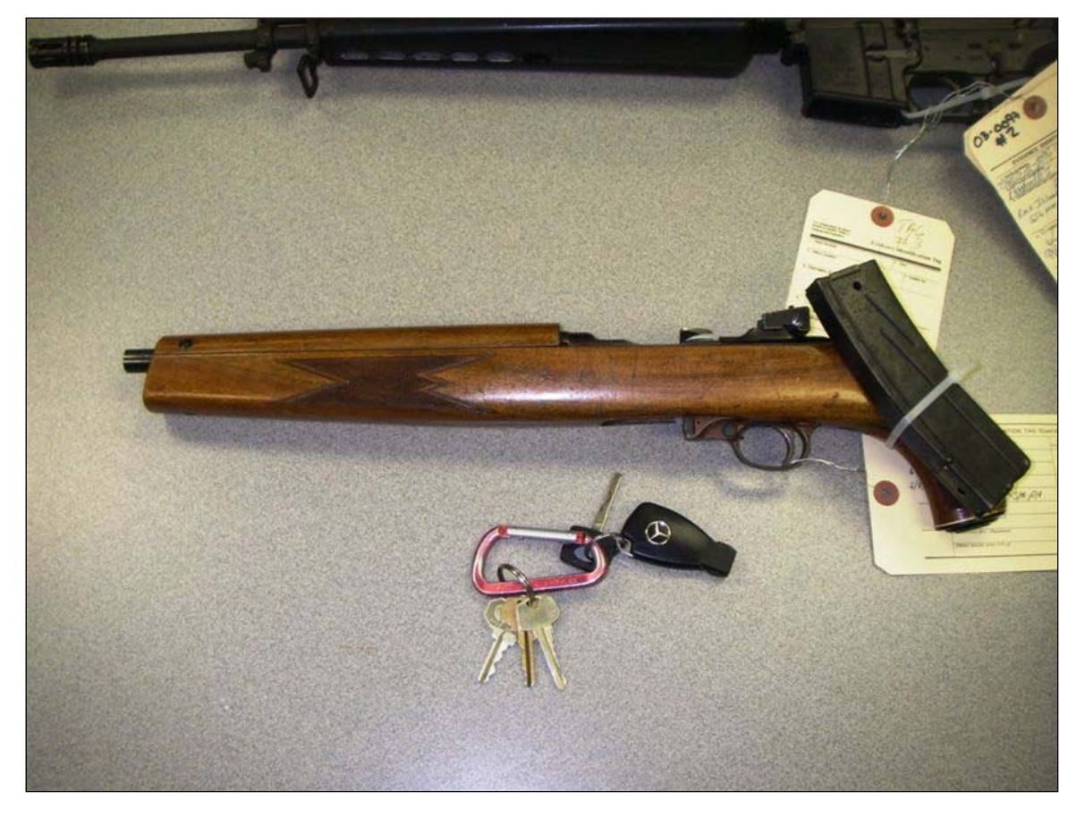
Page 6 of 24 Case 3:05-cr-00213 Document 30 Filed 08/04/2006 Page 6 of 24