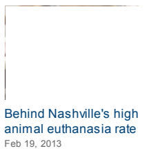
Behind Nashville's high animal euthanasia rate Feb 19, 2013