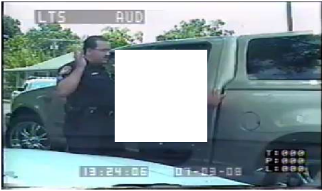
8/19/11: Sheriff vows appeal as shackled mom gets $200K